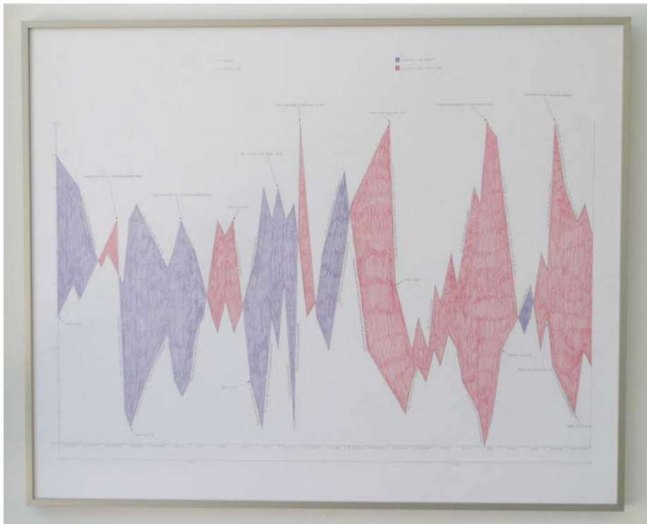
Romantic Division, 2006, pencil on vellum