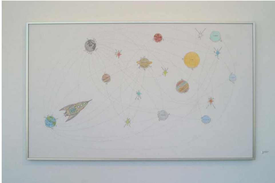
Spiritual Division , 2006, pencil on vellum